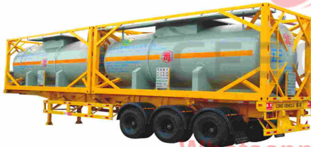
CEEC 9400GY 20 Feet Container Tanker