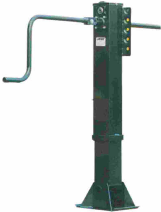
JOST C200 Landing Gear