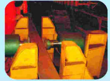
Hydraulic I-Beam Straightening Machine