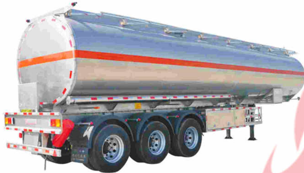
CEEC 9400GRY Tri-Axle Aluminum Tanker Trailer