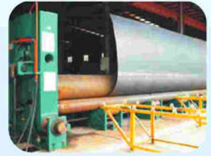
9.5M Universal CNC Plate Bending Rolls