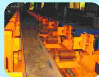
I-beam Assembly Equipment