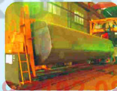
Special Tank Automatic Girth Welding Machine