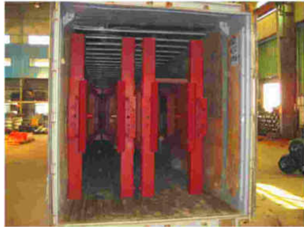
SKD Packing For Flatbed or Skeletal Trailer