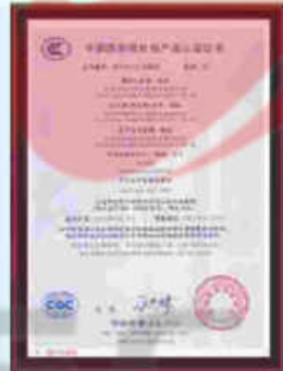
Chinese Mandatory Product Certification Certificate (CCC Certificate)