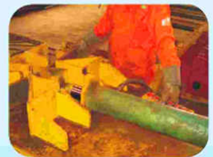
Flange CNC Bending Machine