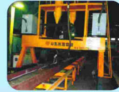
I-Beam Automatic Arc-Submerging Welder