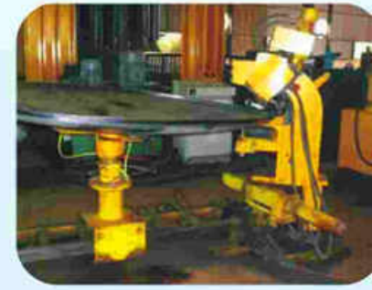
Automatic Irregular Head Spinning Machine