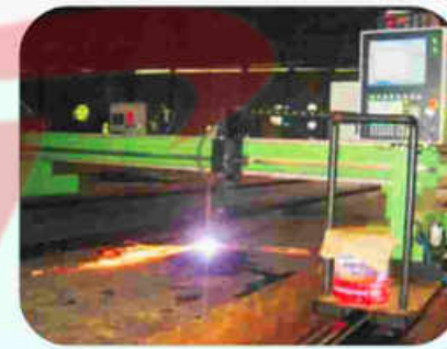
CNC Cutting Machine