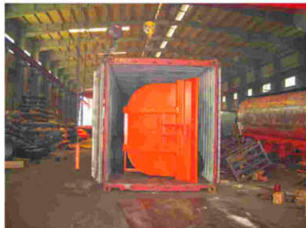
SKD Packing For Dump Trailer