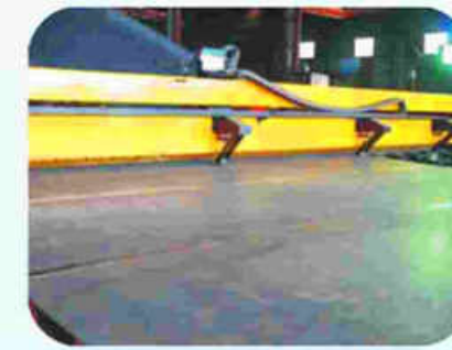
Jointedboard and Butt Joint Automatic Welding Machine