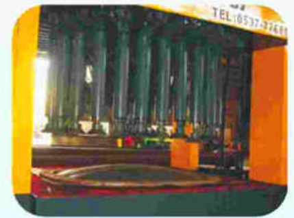
Endplate Shaping Machine