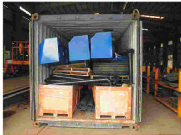
SKD Packing For Tanker