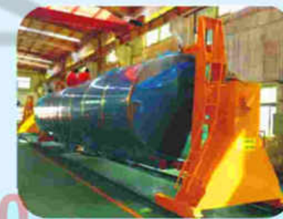
Tank body NC welding positioner