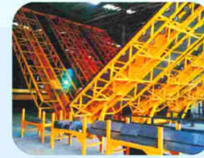
Panel Turnover Machine