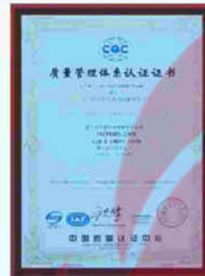
Production License Trademark SGS Certification Certificate SON Certification Certificate The ISO9001: 2008 Quality System Certification Certificate